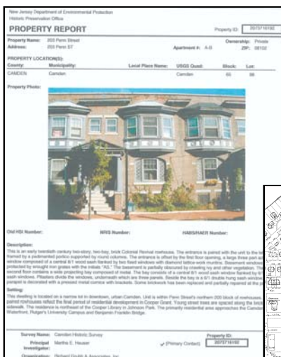
Cooper Grant Historic District Property Report (left) and part of Fairview Historic District, Camden (below)

As Camden’s long-term redevelopment makes significant strides, RGA will help city officials keep historic preservation a priority. RGA’s architectural historians have created a record of Camden’s various historic resources through the use of GIS mapping, a comprehensive database, and film-based photography. 🏠