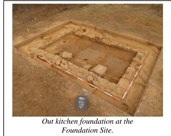
Out kitchen foundation at the Foundation Site.

region. By the middle of the eighteenth century, rural colonial settlers began to erect homes and some farm buildings on more durable stone foundations. After each site was abandoned, almost all available building material, including foundation stone, was gathered, recycled, and reused in the construction of nearby farmsteads. It is possible that some buildings were even lifted off of their foundations and relocated, a popular method of reusing buildings during this time.