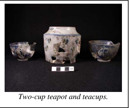
Two-cup teapot and teacups.

Another time of gathering, and one that transcended class lines, was the tea ceremony. Recovered teaware was more refined and ornately decorated than most tablewares, and utilitarian wares found. Ordinarily displayed on open shelves in cupboards,