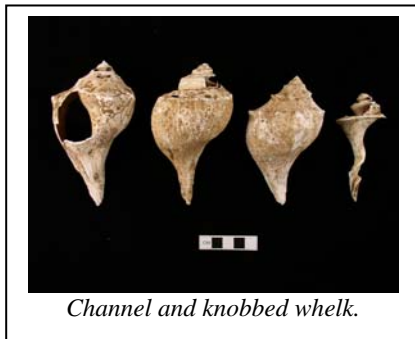
Channel and knobbed whelk.

The residents had a diet comprised mainly of domesticated animals, including chicken, cow, pig, sheep, and goat, supplemented by wild animals like turtle, deer, clam, oyster, and whelk. They also ate meat cuts not common today, such as jowl. Each farmstead