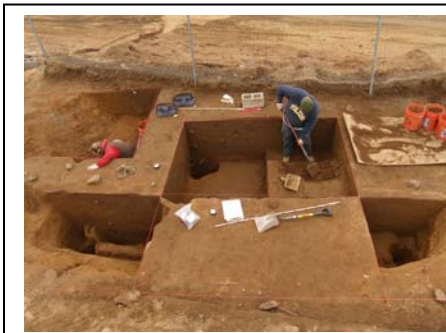
Archaeological excavation of a post-in-ground house at the Foundation Site.

unique opportunity to recover significant information about 18 th - and 19 th -century life among the rural upper class in Monmouth County. All three farmstead sites were eligible for listing on the New Jersey and National Registers of Historic Places. K. Hovnanian Homes and Manalapan Retail Realty Partners funded the archaeological excavations.