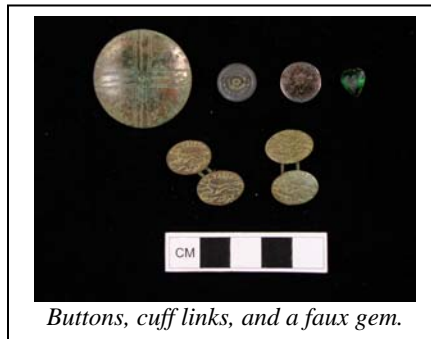
Buttons, cuff links, and a faux gem.

these expensive imported vessels offered a hint of decoration in rooms with otherwise unadorned walls. Tea was consumed during times of relaxation and when guests called. It often served as a socially engaging time when residents could discuss the pleasantries of life, nature, news, family affairs, and politics. Locally made ciders and cider spirits (applejack) were equally as popular. Produced from apples grown on farm orchards that dotted the State's landscape, New Jersey ciders and cider spirits were heralded by travelers, foreign visitors, and locals alike. Commonly stored in jugs and large wooden barrels, most country folk owned an ample supply and often preferred it to imported wine.